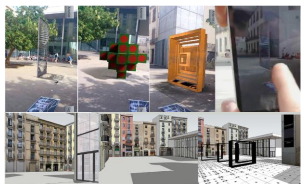
Fig.6. Viewing generated models on location (top row); urban with early intervention proposals (bottom row); Source: [24].

However, experimental results showed some problems; for example, used markers had to be placed within 10-15m of the users due to technical limitations imposed by the resolution of phone cameras. This created problems because it was not possible to move away from the marker to get a wider perspective of the environment. As such, the most obvious result was that the size of the sculptures using AR visualization should not exceed 2.5 meters in the height to be adjusted.