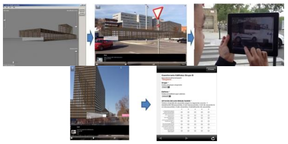
Fig.7. Visualization sequence of geo-referenced models (top row); 3D model visualization and questionnaire responses on the site (bottom row); Source: [29].

Experimental results: the global opinion was rated very positively, despite having no prior knowledge of it. The overall assessment was rated at 4.27 points out of 5, which confirmed the feasibility of using MAR in educational environments. In relation to MAR technology and software, responses confirmed that performance improvement of handheld devices has made them useful tools for using AR technology in architecture. In relation to usability, the results showed that despite the limited interaction with the small size of their screens, it seemed to be enough to guarantee the feasibility of these experiences. However, the researchers believe that greater computational capabilities are needed (complex model rendering, or simultaneous analysis of several options). The results concluded that geo-location, AR, and mobile technologies are becoming accessible and easy to use, and increasing student satisfaction and interest in the course content, as they feel very motivated.