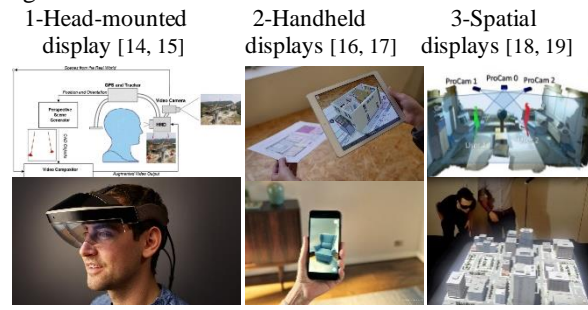
Fig.3. Different types of displays and hardware technologies used for augmented reality.

C- Spatial Displays (SD) /Projection displays: project virtual component onto the surface of physical objects either a single object (virtual table, wall) or cover the entire room. SDs use projectors, or holograms. SDs offer both 2D and 3D images [13]; Fig.3-3.